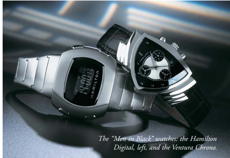
The "Men in Black" watches: the Hamilton Digital, left, and the Ventura Chrono.

In addition to innovation in design, there is plenty of innovation in watchmaking itself. The high level of craftsmanship, incredible power reserves, beautiful sound quality of gongs, new movement technology—we are amazed by it all.