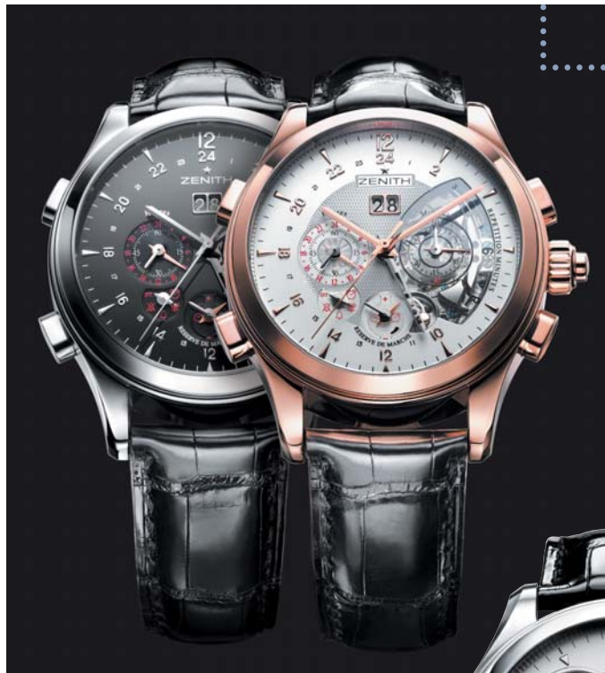
from top—Zenith Grande Class Traveller; Zenith Grand Class Open; Rolex Daytona.

Watch lovers know there are many different ways to read the time. Regulators, jumping hours, retrograde displays and crazy hours intrigue us.