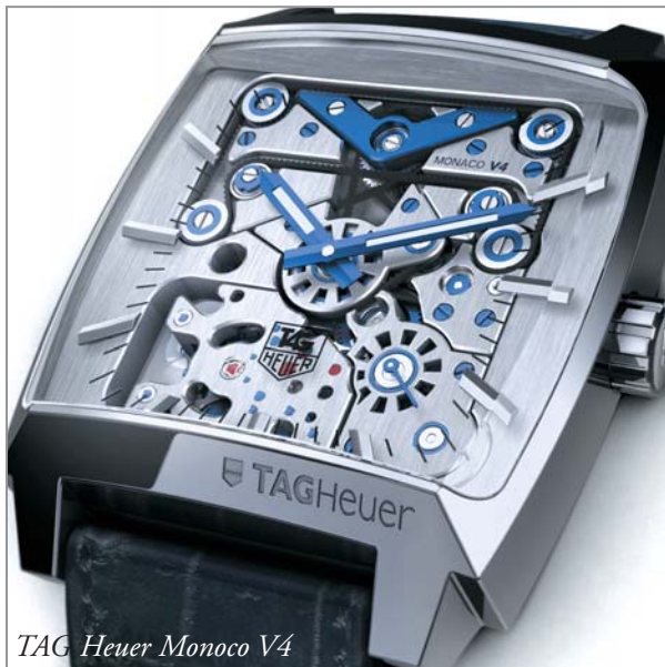
TAG Heuer Monaco V4

If a watch can do anything more than tell the time, we are in awe and want to see how it is accomplished. Some of the most complicated watches have an amazing number of parts, and we love to be able to see them in action; even the simplest mechanical movement has more than 100 parts.