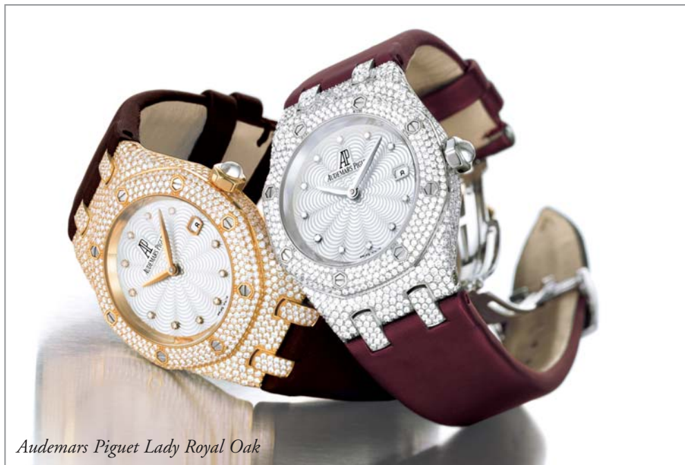
Audemars Piguet Lady Royal Oak