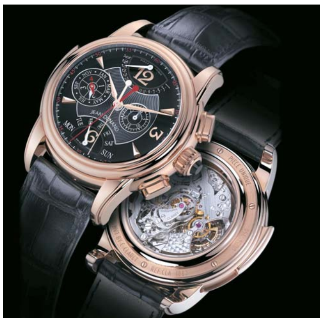
clockwise from top—Patek Philippe Annual Calendar Chronograph, Ref. 5960P; Corum Baron Samedi Bubble; Jean Dunand Grande Complication.