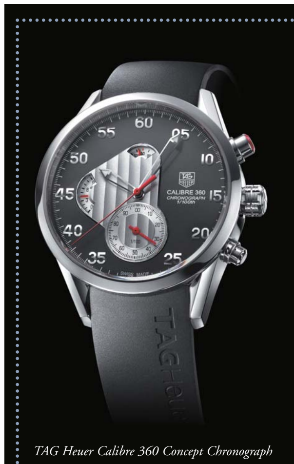
TAG Heuer Calibre 360 Concept Chronograph

Watch companies are always on the look out for the next great material. High-tech ceramic, meteorite, colored diamonds, titanium, Superluminova, carbon fiber, stingray straps, palladium—top makers have used all of these and more.