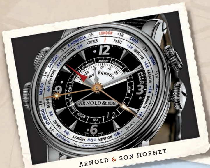
ARNOLD & SON HORNET