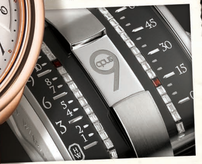
HARRY WINSTON OPUS 9