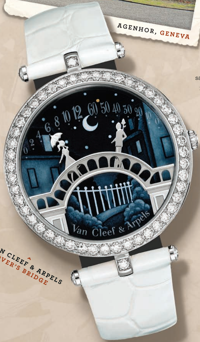
VAN CLEEF & ARPELS LOVER'S BRIDGE

"I have to think about a project a long time before I begin to work on it," he continues. With computers, you can do things that were never possible before, but often these new designs don't work. My clients have to be able to sell the watches I make, so quality is the first thing we work on."