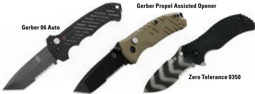
Gerber 06 Auto