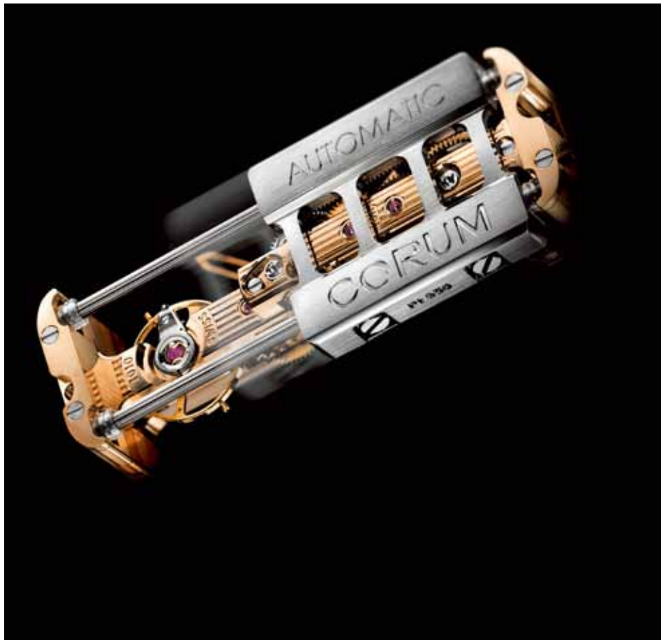
▲ Corum Golden Bridge Automatic Movement