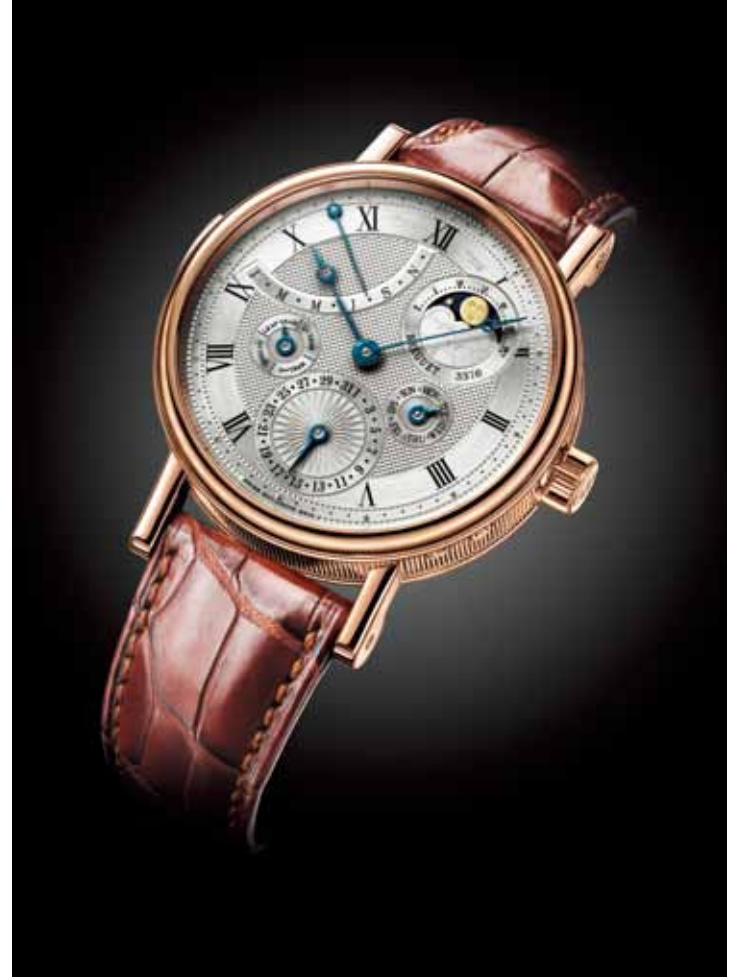
▲ Breguet Classique Minute Repeater