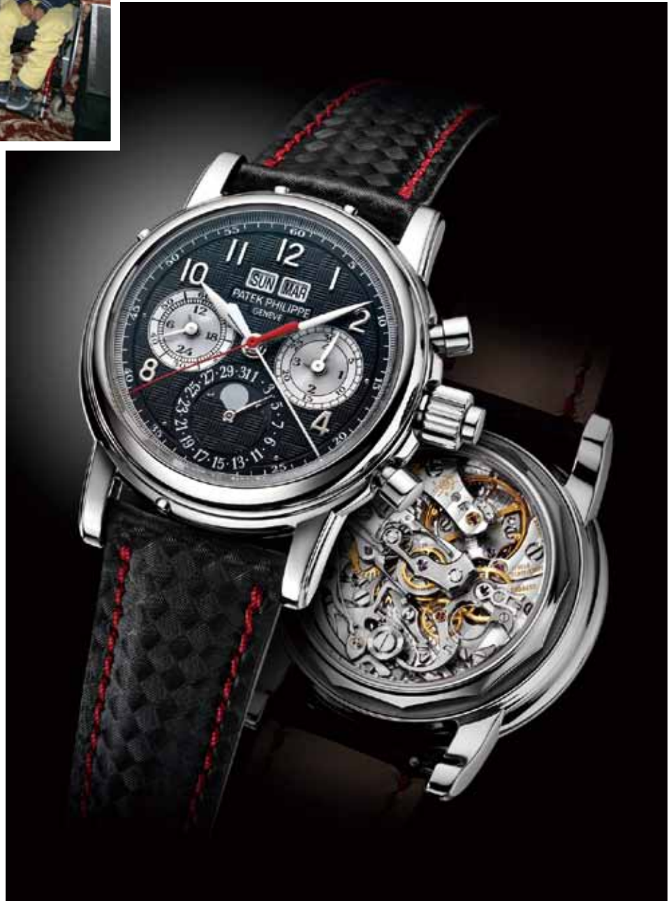
▲ Patek Philippe one-of-a-kind Only Watch offering, which sold for almost $4,000,000