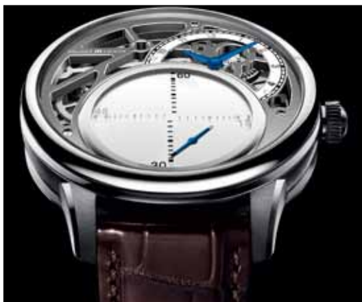
▲ Maurice Lacroix Masterpiece Seconde Mystieuse

Complications make watches more interesting. Sure, we all love the elegant simplicity of a three hand watch, but there's nothing like the melodious chime of a Minute Repeater, the spinning magic of the tourbillon or the truly useful display of a GMT. So, next time you are in the watch store, don't shy away from the timepieces that seem "complicated."