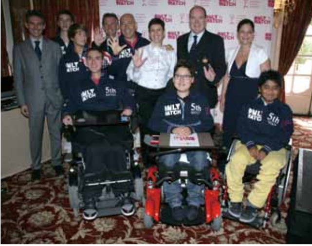
▲ The Only Watch Group