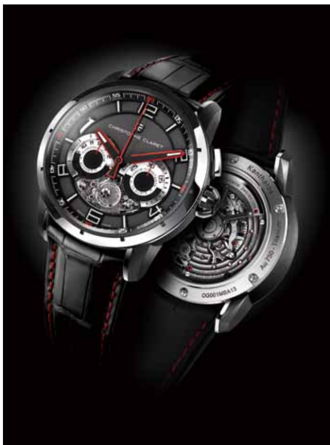
▲ The Christophe Claret Kantharos is a monopusher chronograph striking on a cathedral gong, with a constant force mechanism in a fully integrated automatic movement.