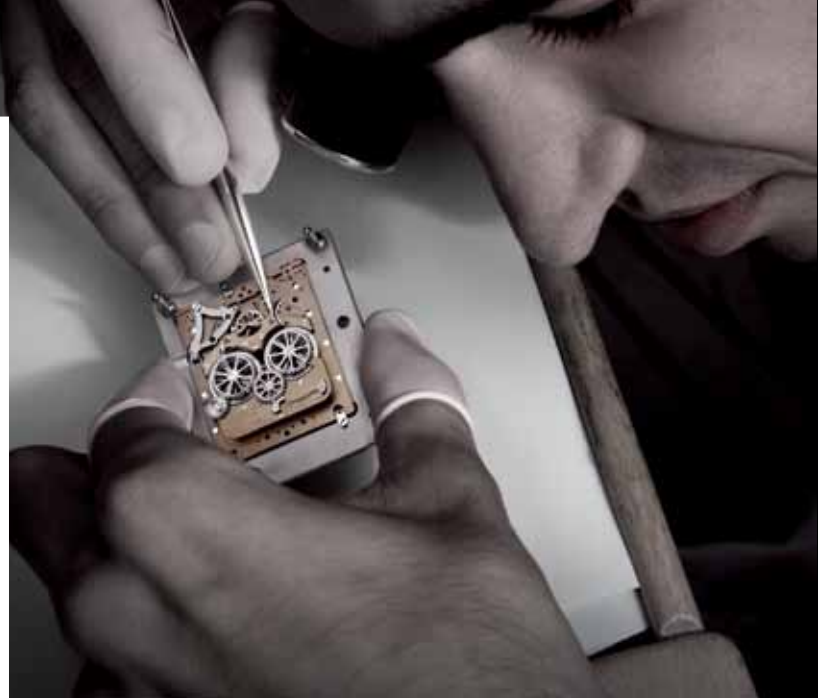
▲ A Christophe Claret watchmaker at work