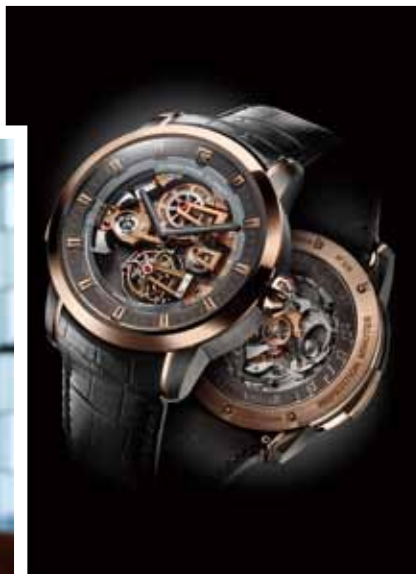
▲ Christophe Claret Soprano in Rose Gold