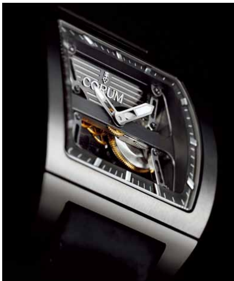
▲ The Corum Ti-Bridge Automatic Dual Winder is the first automatic watch in the Ti-Bridge line, using a system of two interconnected inline oscillating weights.