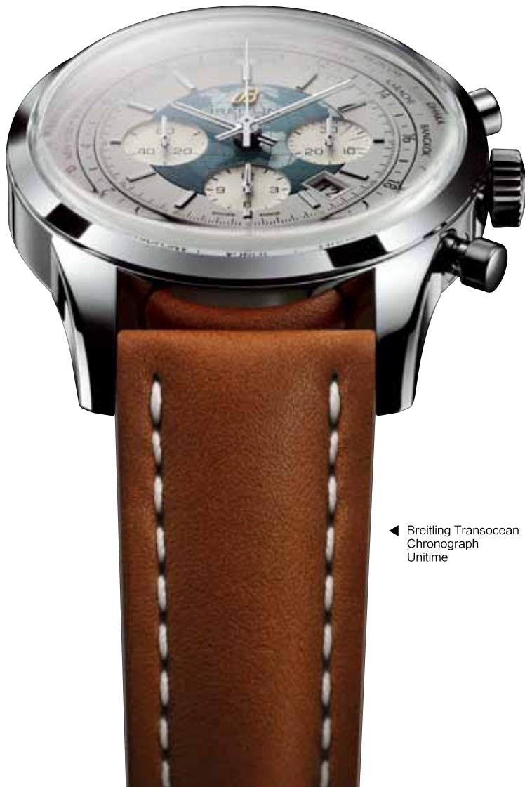
◀ Breitling Transocean Chronograph Unitime