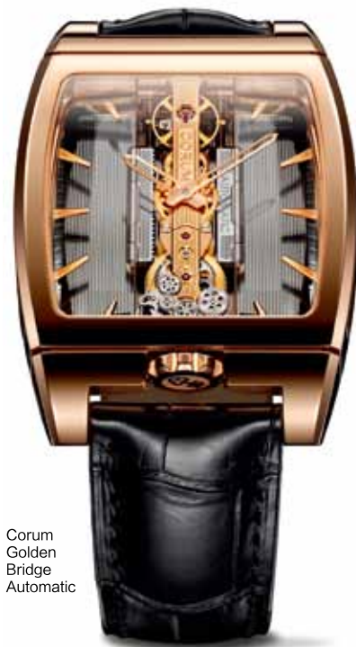
▶ Corum Golden Bridge Automatic