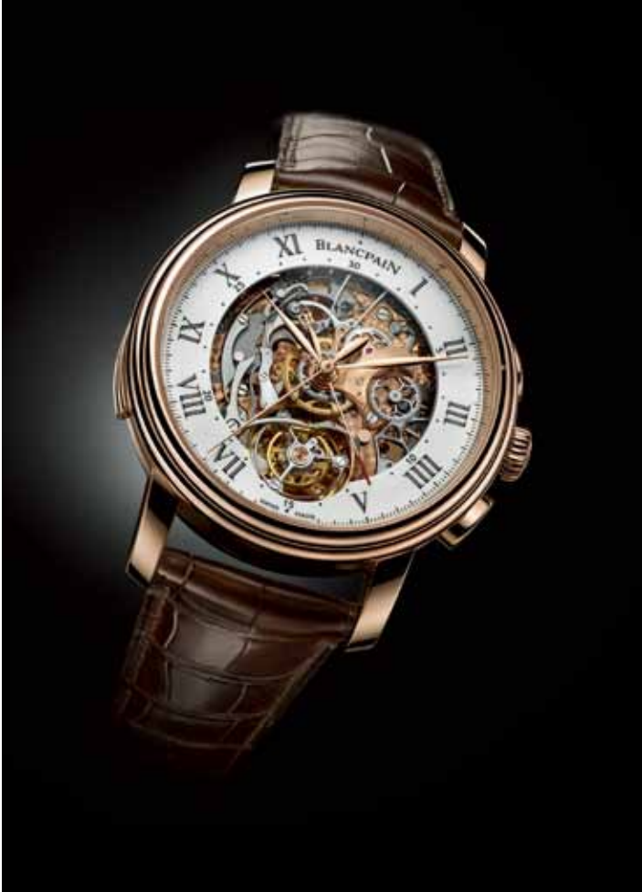
▲ Blancpain Le Brassus Carrousel Répétition Minutes Chronographe Flyback