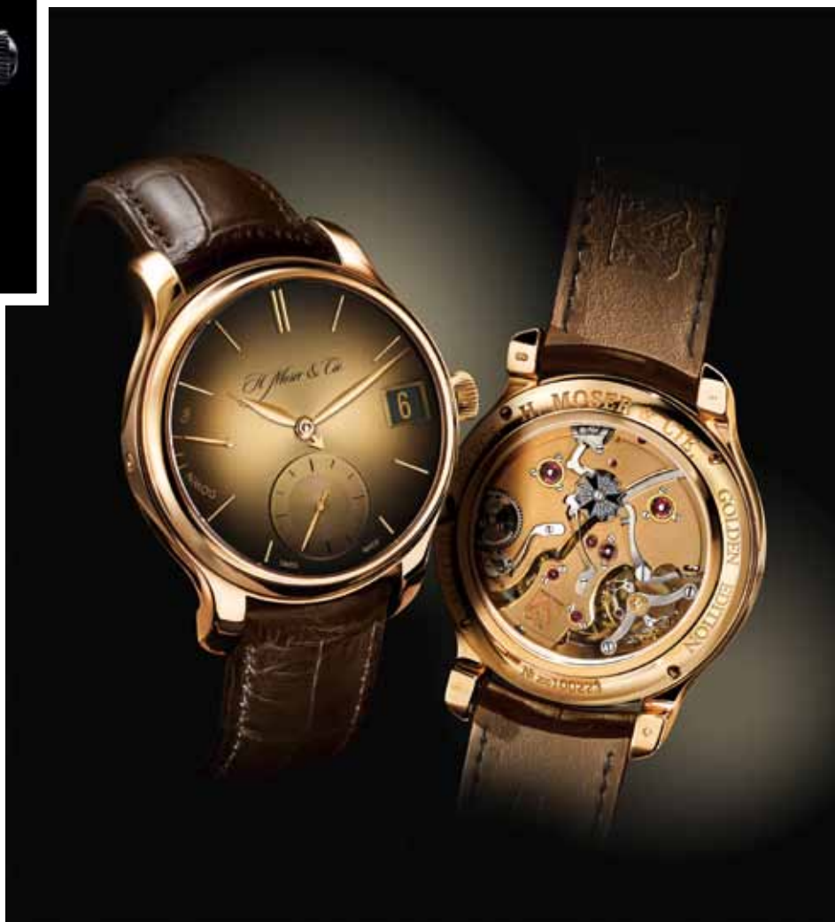
▲ H. Moser Perpetual 1 Golden Edition

如果你想劳驾月亮将她的阴晴圆缺体现在表上，就得动用这项功能。那枚独特的月相盘会应时转动，体现月球活动的不同时期。