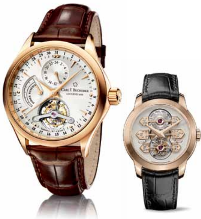
▲ Carl F. Bucherer Manero Tourbillon