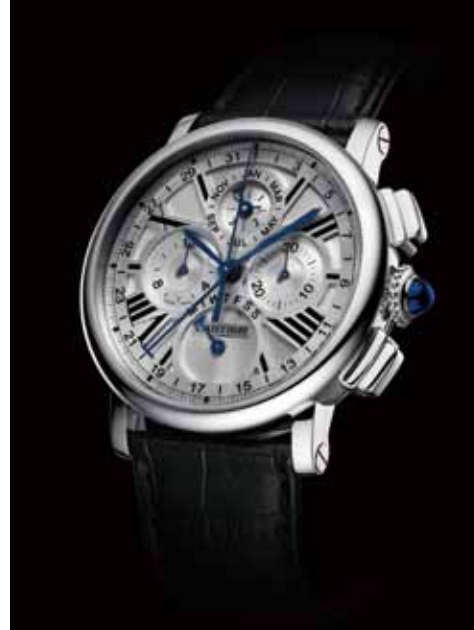
▲ Rotonde de Cartier Perpetual Calendar Chronograph

This is a watch that chimes out the time (hours and minutes) when a lever is activated. The Minute Repeater is considered one of the most complicated watches to manufacture.